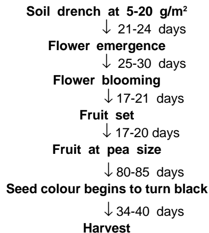
Fig. 1. Diagrammatic scheme for control flowering in longan using potassium chlorate as soil drench.

Chlorate ion can enter the plant from both leaves and roots via absorption (Audus, 1976). Thus, the methods of applying chlorate include soil drenching through root and foliar spray through leaves. It is believed that the chlorate ion moved in the xylem cells, and worked by fixing with nitrate reductase enzyme to release one atom of oxygen to form chlorite ion ( \text{ClO}_2^- ). This chlorite ion will inhibit nitrate reductase enzyme. As the nitrate reductase enzyme is formed by stimulating of the substrate inducible enzyme, therefore the chlorate ion would help in inducing the forming of nitrate reductase mRNA as the activity of this enzyme increased whereas the activity of nitrate reductase